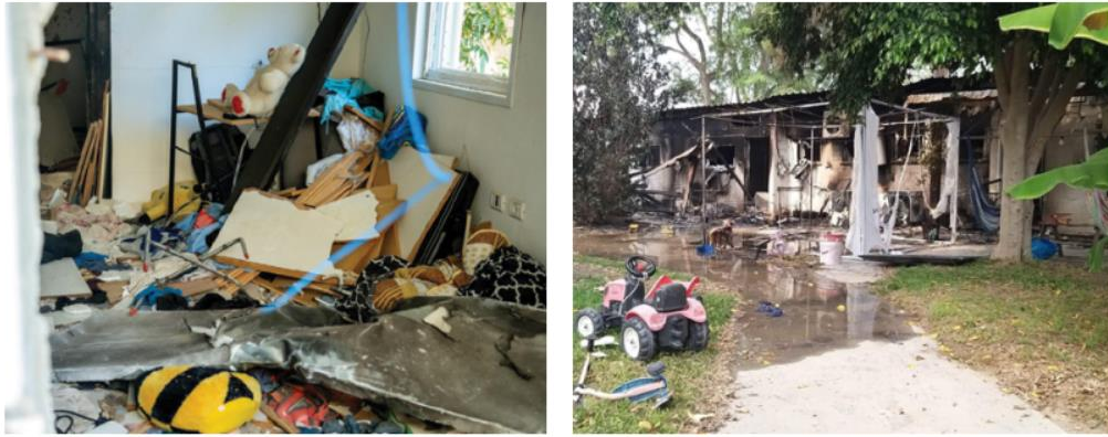
Wreckage from Kibbutz Alumim – Oct. 7 th

Currently, the new Gymboree is in the construction phase. Once operational, it will be open on weekdays and evenings, catering to young families with children aged 0-5. The Gymboree will provide a family support system with professionals who can observe children and detect signs of developmental, emotional, social, and physical issues early on. This early detection will help promptly connect parents with community resources.