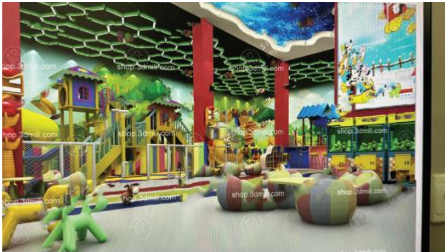
The photos are for illustration only

Your contribution is crucial in helping these families regain stability and continue their lives despite the ongoing threats. We sincerely thank you for your support of this vital project.