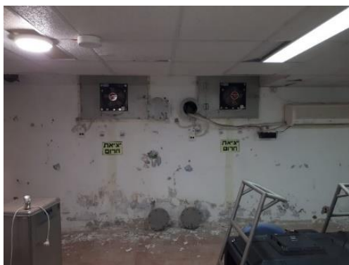
Before – ventilation issues, poor maintenance