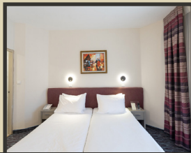
Royal Jerusalem Hotel